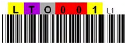
SS Type 2