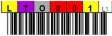
Bottom Barcode Orientation