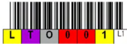
Top Barcode Orientation