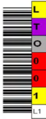
Left Barcode Orientation